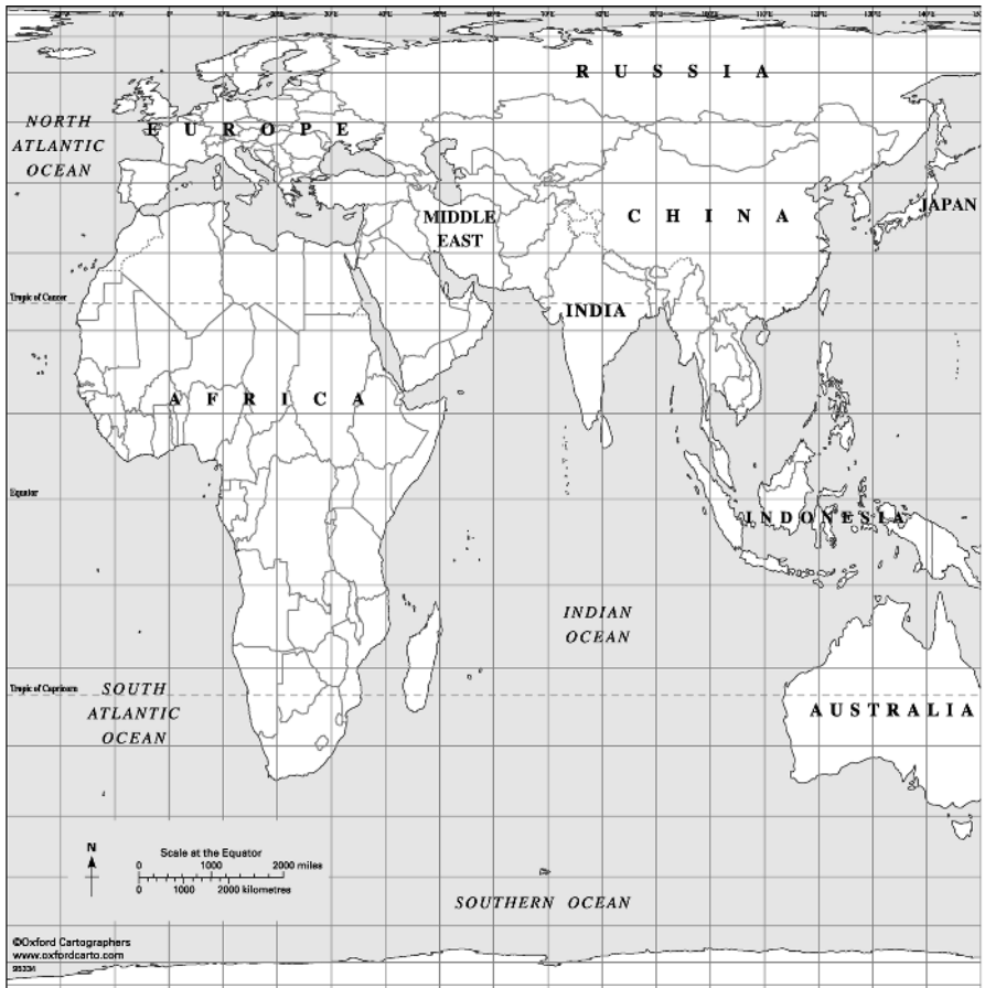
Map 1 Hobo-Dyer projection of the world